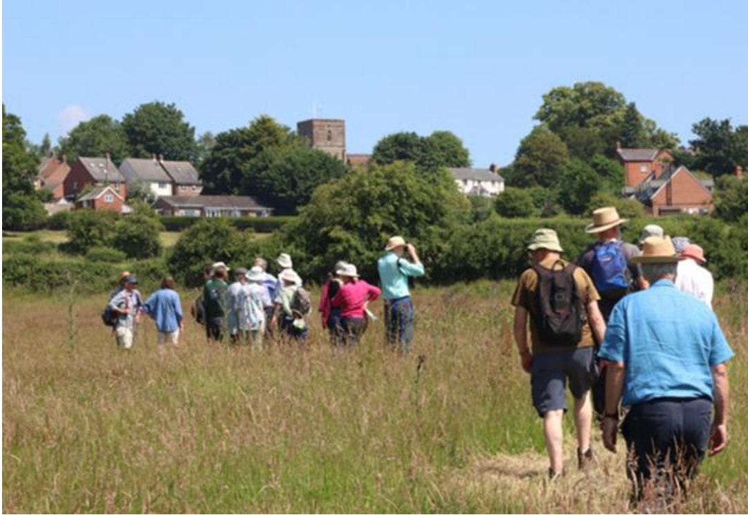
Ail Meadow Nature Reserve - Woolhope

It is envisaged that the conference presentations will be compiled into a published book of 150 pages, both hard copy and e-publication, which will be given to conference participants and libraries.