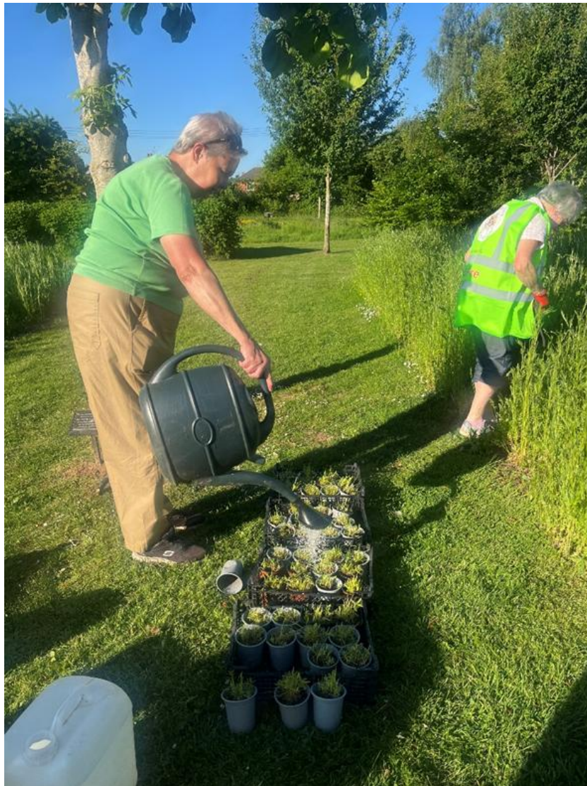
Volunteer watering plug plants

developments. The project is bringing nature to an otherwise built-up area of the town and there has been a marked increase in the number of people using the park since the area has been developed.