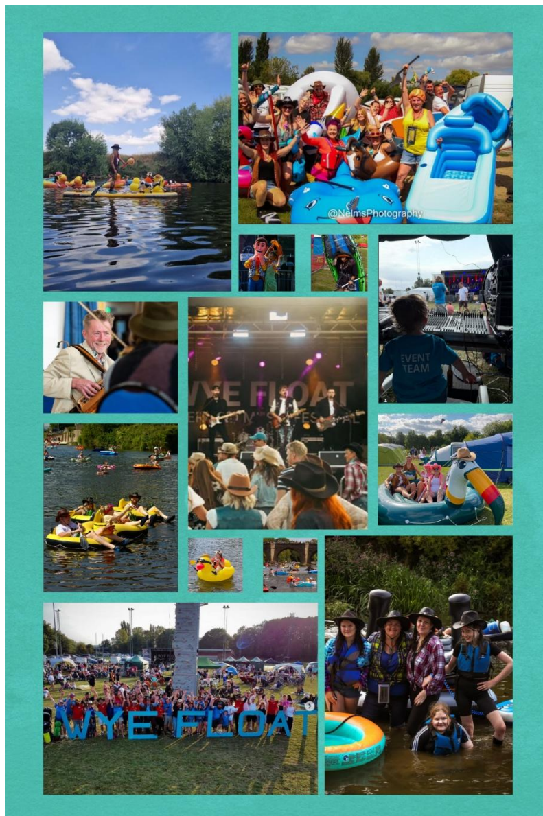
Wye Float River Festival 2025

For the wider community, the grant helped ensure the festival was well-organised, inclusive, and safe, allowing people of all ages to come together and enjoy a unique local event. The presence of trained volunteers and appropriate equipment improved safety standards and enhanced the overall experience for participants and spectators alike. The festival strengthened community connections, encouraged volunteering, and promoted pride in the local area and the River Wye.