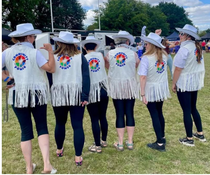
Community First at Wye Float River and Music Festival