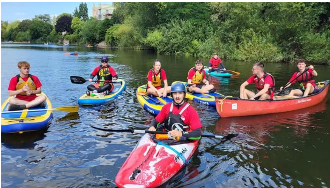
Volunteers on the River Wye, Hereford

Hiring essential equipment and providing training allowed 85 new volunteers to participate safely and confidently in the festival. Many of these volunteers gained new practical skills,