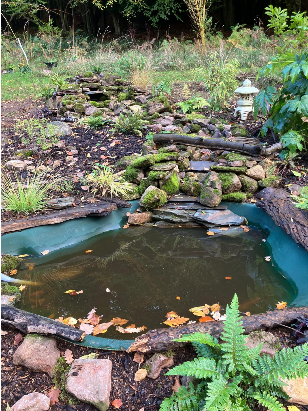
Wildlife Pond at Govardhan Eco Farm

The pond and its surroundings will continue to grow and flourish through ongoing planting and care, creating an even richer habitat for wildlife and a hands-on learning space for everyone. The knowledge and skills gained during the project are already shaping future land-based initiatives on the farm, and the excitement is contagious. More and more visitors and volunteers are eager to roll up their sleeves and get involved.