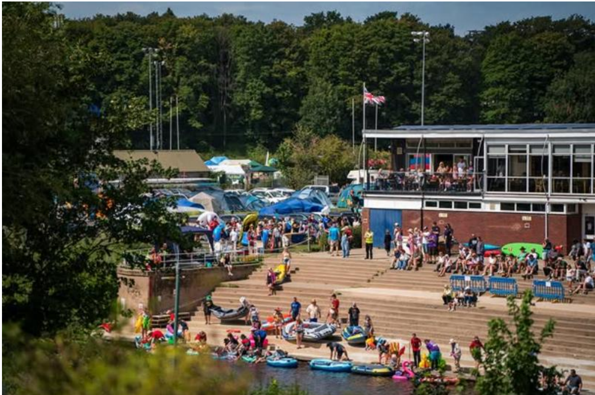
People taking to the river at Wye Float River Festival 2025

The qualification has increased his confidence to respond effectively in emergencies and enhances the Wye Float health and safety provision.”