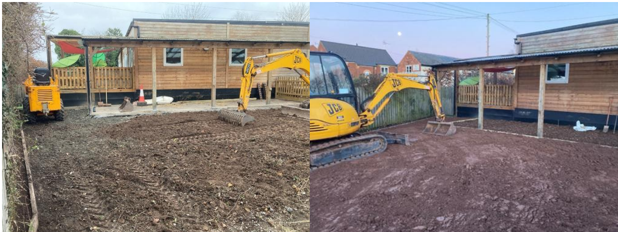
Groundworks at Madley Preschool

The grant recipient was allowed 6 months to raise additional funding and work began last term to clear the site and remove all the spoil. The area has been landscaped and filled with topsoil. Bark has been laid under the cover, the pond has been dug and the ground prepared for laying turf and planting trees.