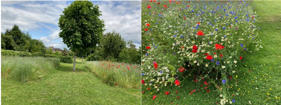
Wildflowers in the Nutgrove.

“We were delighted to welcome a man who had heard about us through the church. He asked if he could join us, although his circumstances were difficult. He was concerned that he didn't have any equipment, as he was currently housed in a hotel and had been sleeping rough. We were able to reassure him that we would provide all the necessary equipment and that he would be very welcome to join us. He enjoyed his time with us and related stories of having tended his mother's garden in the past.”