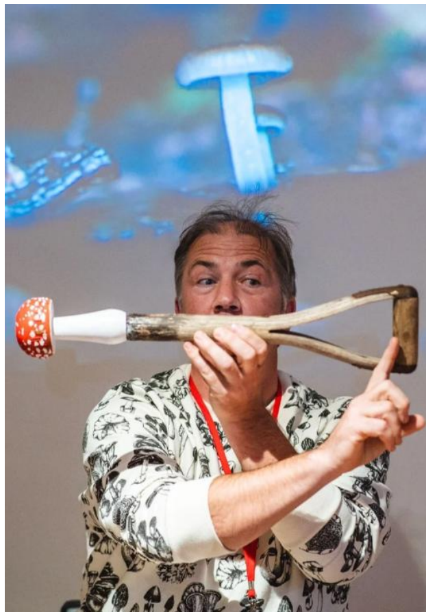
Fungi Workshop at Fungi-Town 2025

Fungi Town was volunteer-led by local people and over 45 individuals gave up their time as stewards, photographers, planners, hosts, drivers, and more.