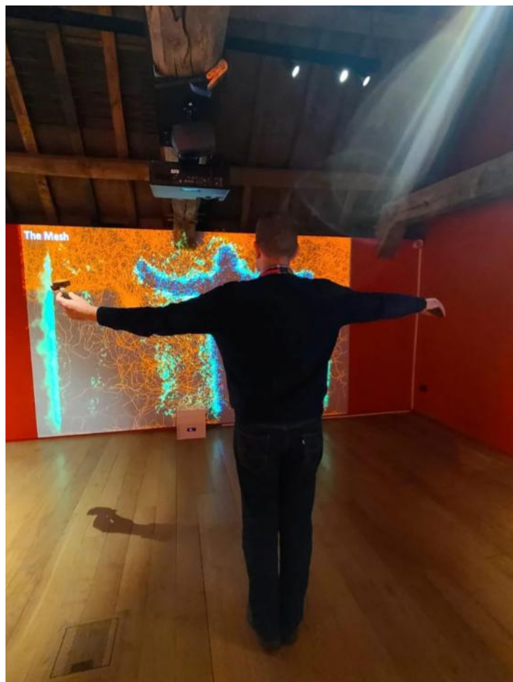
Interactive Digital Art at Fungi-Town 2025

Hay Castle Trust planted a Reishi and bonsai forest in the castle gallery alongside a fungally-inspired digital art show. There was exhibitions of mycelium furniture, the UK's rarest fungus, and an extraordinary wheel of mushrooms created by a talented local artist.