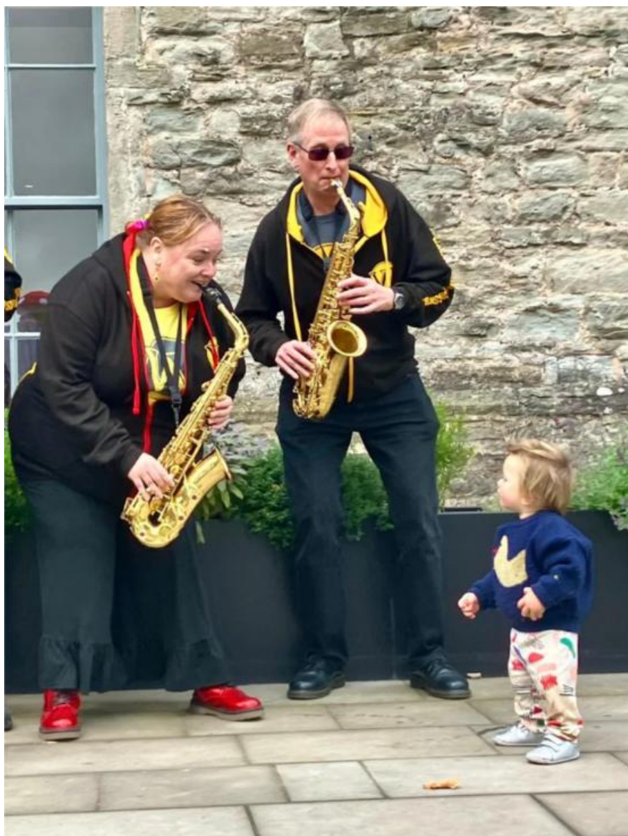
Wonderbrass perform at 'Puffball Parade – Fungi Town' in Hay-on-Wye