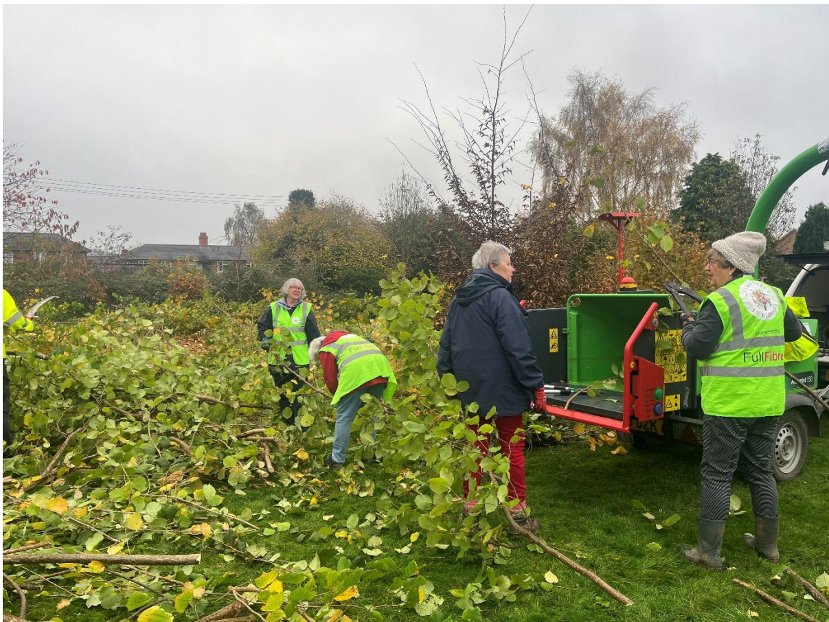
Volunteers coppicing in the nut grove at Sydonia Park, Leominster

Volunteers assisted with coppicing, bramble clearing, preparing the area before planting, as well as the actual planting and sewing.