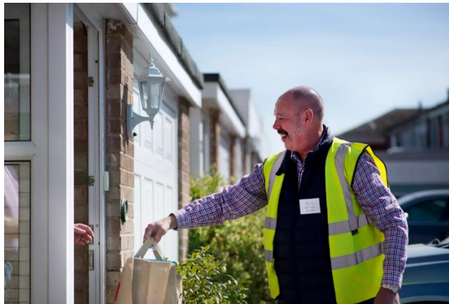
Help with shopping – Ross Good Neighbours Scheme

The Ross Good Neighbours (RGN) scheme aims to help people across the town, Bridstow and Weston-under-Penyard in many different ways and is at the heart of Ross CDT operations. Volunteer teams have provided a range of services for people who are vulnerable and need support, including a home shopping service for those who are isolated, pet care, light DIY or gardening tasks. They also have a 24/7 messaging service, which is used as a dedicated Helpline. During the funding year, volunteers completed 283 shops for 13 customers.