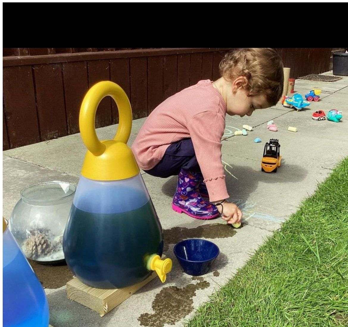
Child chalk drawing with Hereford Nurture through Nature