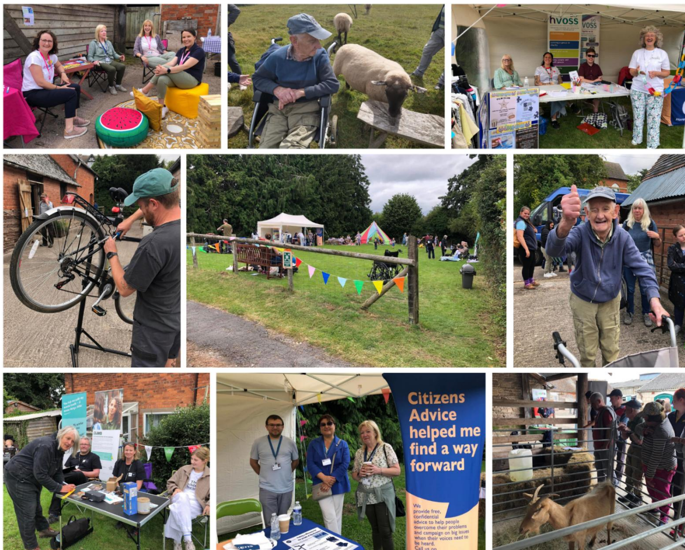
Routes of Connections event at Hereford Community Farm