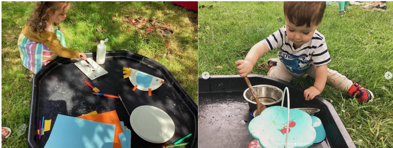
Children playing outside

Many of the adults attending were initially anxious about coming and required a lot of encouragement and reassurance.. After attending one session, people felt it was a non-intimidating space and returned in the following weeks. A supportive group formed in both locations and attendees felt more supported through these new connections. It was useful to work in partnership with Herefordshire Children's Centre, as they were able to refer people and offer additional support if necessary.