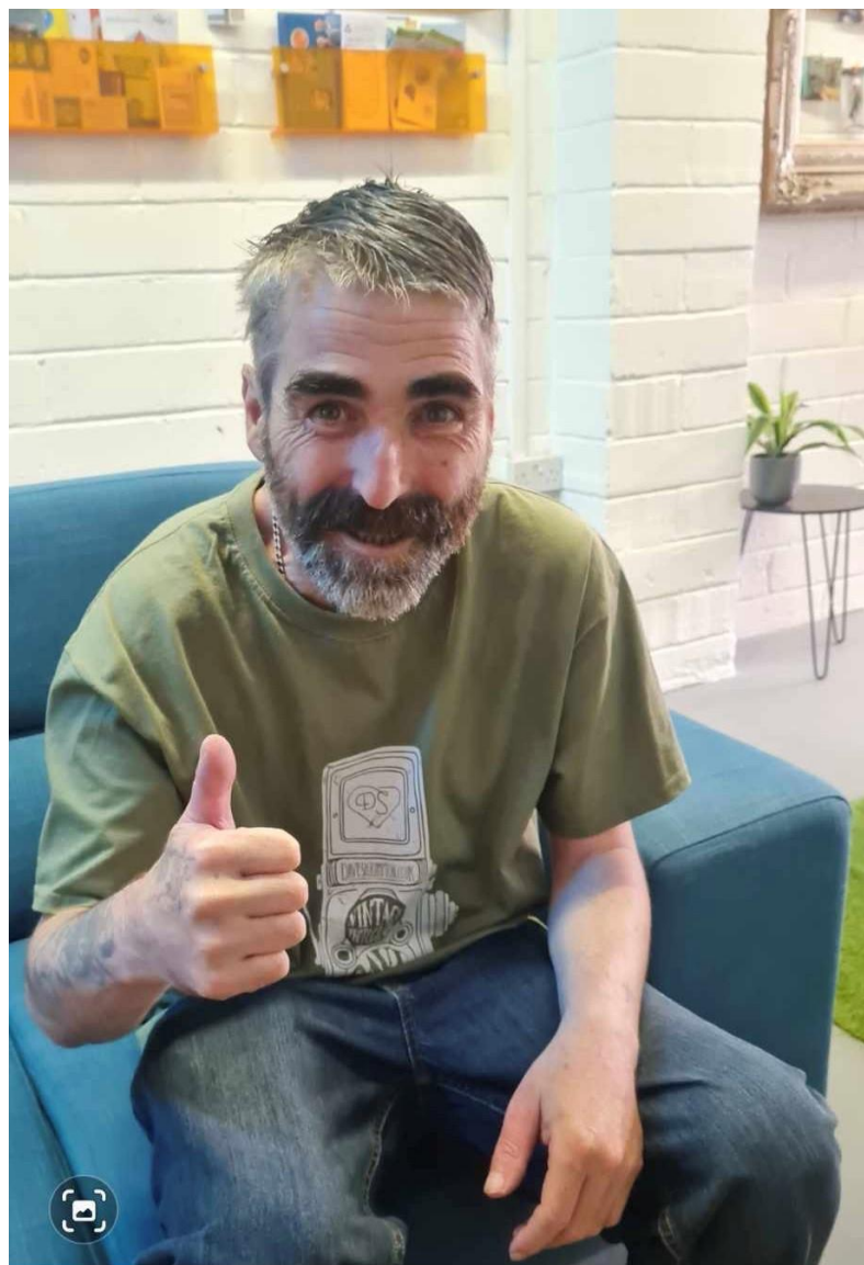
Fresh haircut, shower and change of clothes