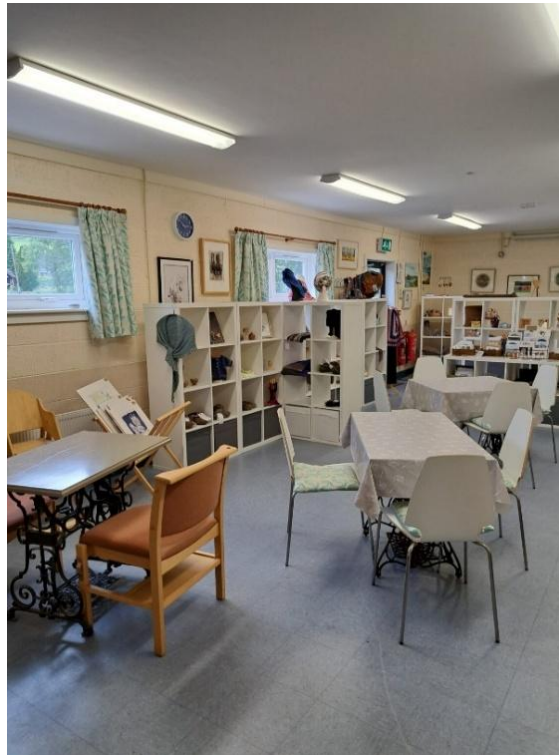
Interior of Arts and Community Centre

It has provided a meeting and social space to help reduce loneliness and isolation in this rural community, with many regular attendees. Volunteers have been aware of residents living on their own, those who experienced flooding, or those who have been in hospital. Even if no physical help was provided, the centre's members welcomed them when they could return to craft meetings, were aware of their situation and gave friendly support or called if someone had not been seen for a while.