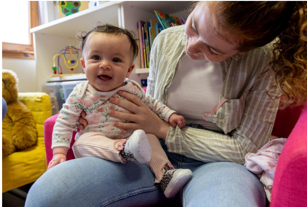
Young mum and baby