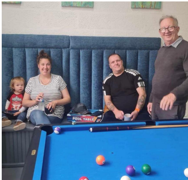
Regular catch up over a game of pool

Through the award from Herefordshire Together Fund of £20,000 @The Hub has been able to pay their support worker an income for 8 months. This allowed her to actively support nearly 100 people and to offer general support to approximately another 50.