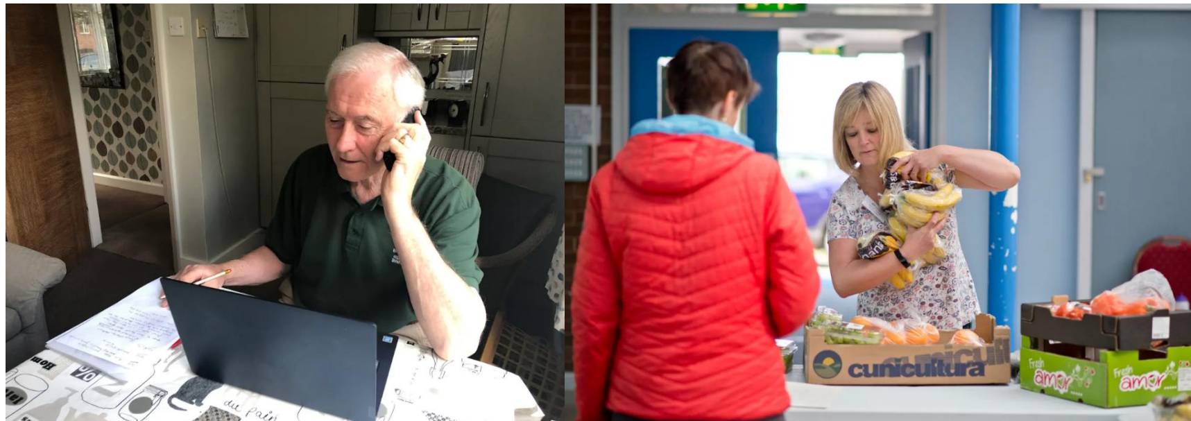
Supporting the community in Ross-on-Wye