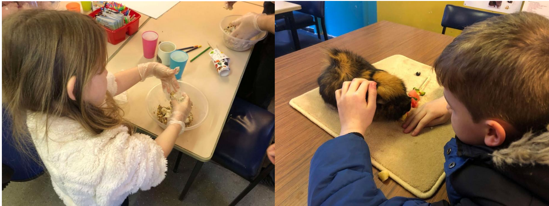
Children feeding small animals

Connections that have developed through the project with statutory services and VCSEs will remain valuable as Herefordshire Community Farms continues to work collaboratively, potentially offering them a space to conduct outreach work.