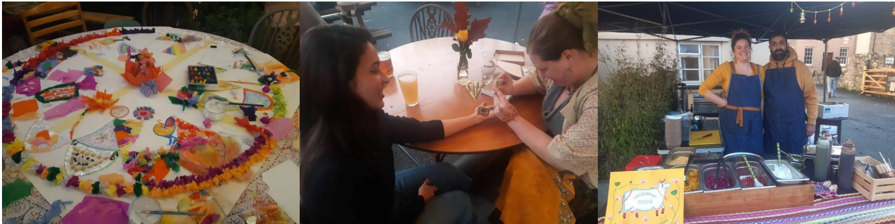
Diwali celebrations at Open Arms Kington (OAK)

All events were free and accessible to all. Examples of these activities can be seen on the OAK CIC website https://www.openarmskington.co.uk/