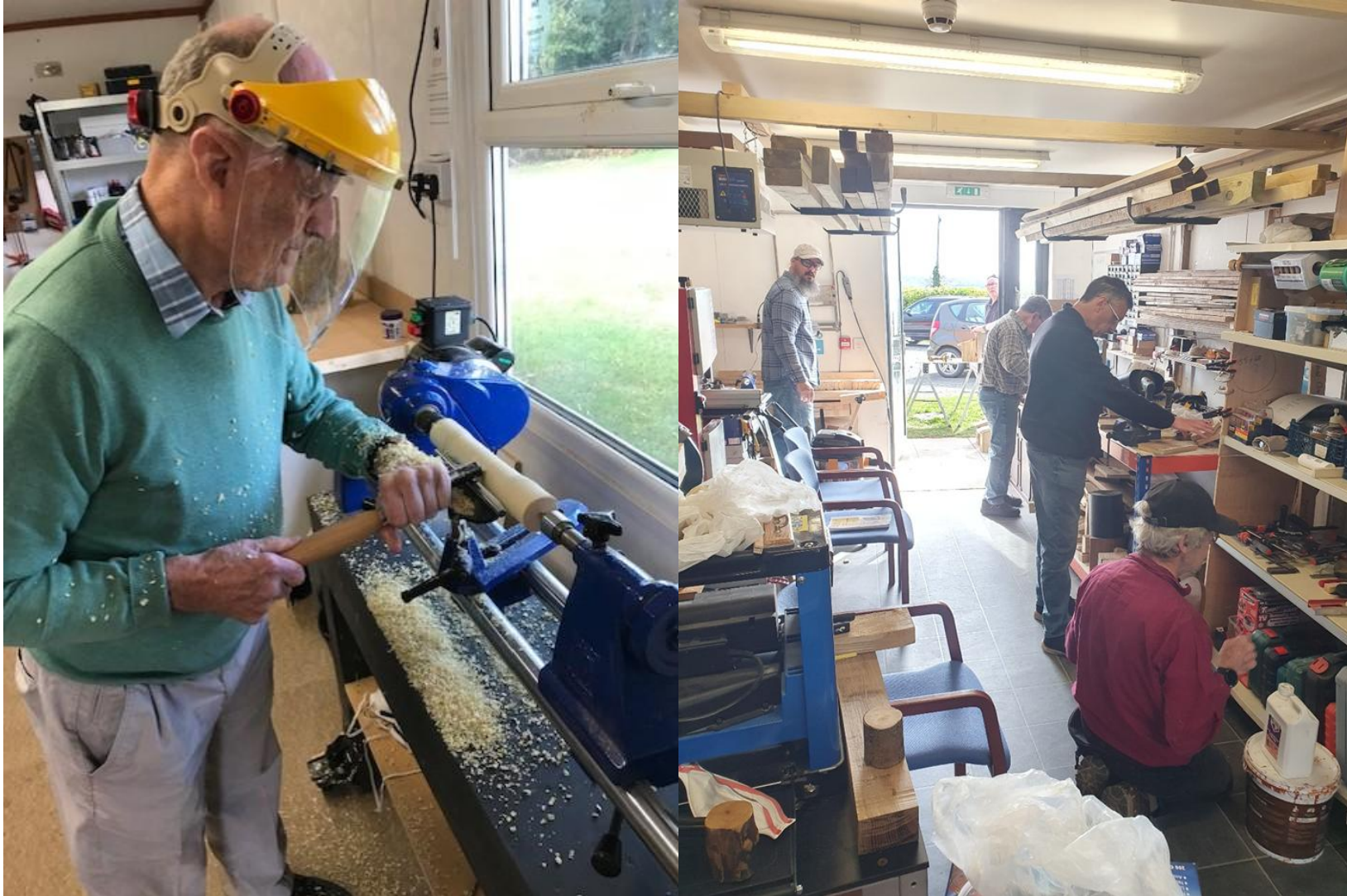
Workshop activities with 'Sheds Together'