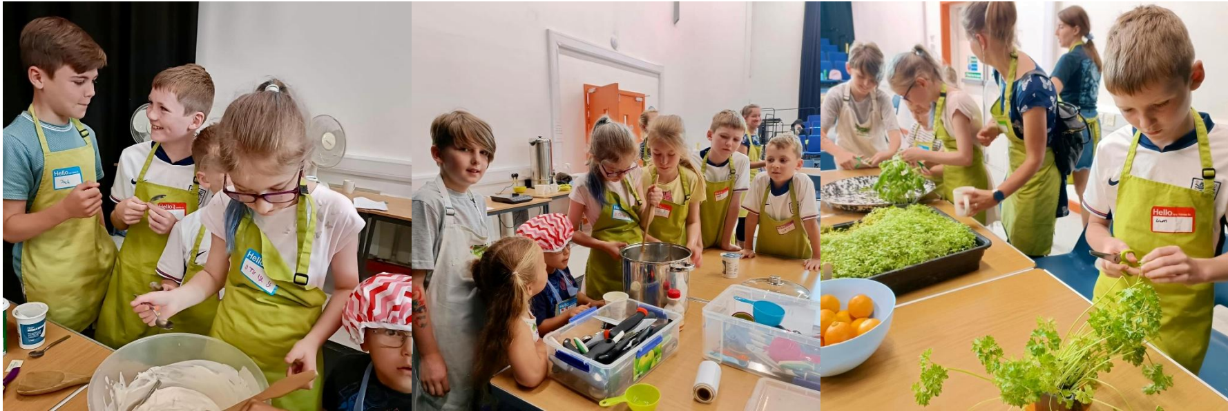
Children enjoying Family Cook Workshops

The workshops were targeted at the South Wye community by distributing physical fliers to all local schools in South Wye before the summer 2024 holidays - Blackmarston, Riverside, Our Lady's, St Martins, Marlbrook and Lord Scudamore and also to the Kindle Centre users.