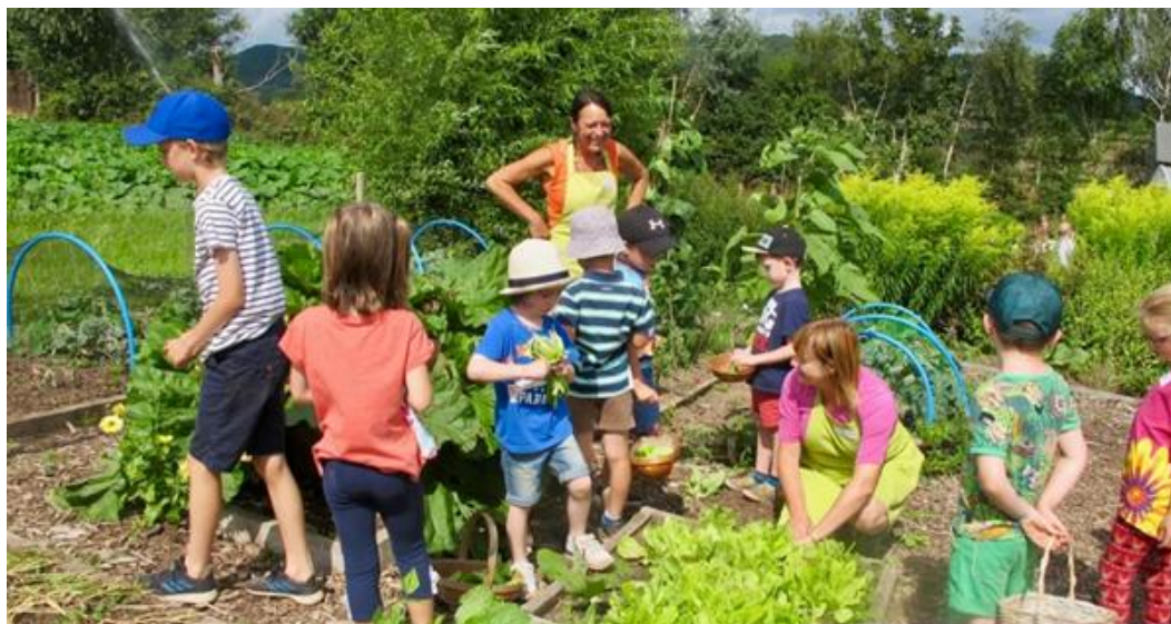
Garden Workshops with Growing Local

“We feel this has driven a greater sense of belonging to our community, both for ourselves as a new project and for the families involved. Family friendships have been forged.”