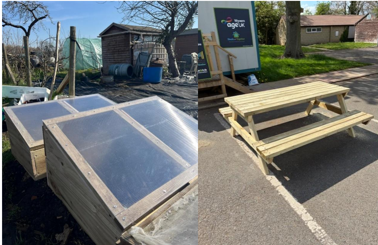
Cold frames and bench produced at 'Sheds Together'

At present, there are 35 participants shared between both 'Make n Mend' Shed locations. Not all attend every session, but there is a core of 15 who do. There are five staff volunteers.