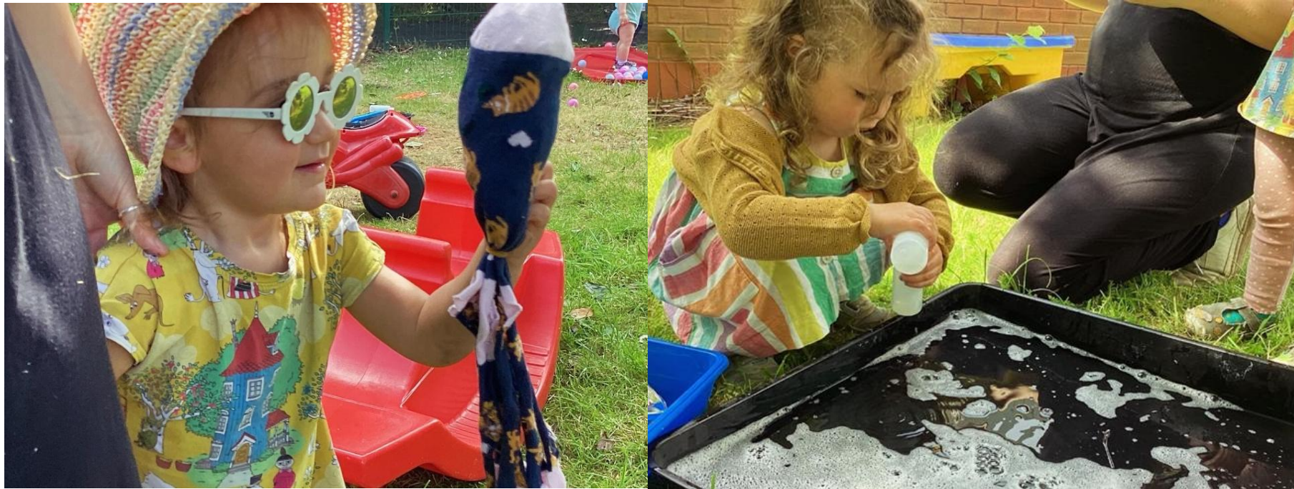
Children's activities at Leominster Children's Centre

Many of the attending adults stated that they felt lonely and some said they didn't have any adult friends whom they could talk to. New friendships were formed as the children played and these were developed over the ten weeks. The adults also benefited from taking part in nature connection activities.