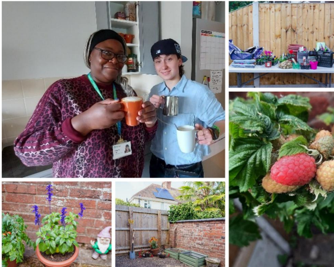
Brierley Court Garden

In summer 2024, a community barbecue was held for people of all ages, especially older members of the community. This event helped bring different generations together, reduced social anxiety, and encouraged young people to feel more confident. It showed how outdoor activities can help people connect and build a stronger community.