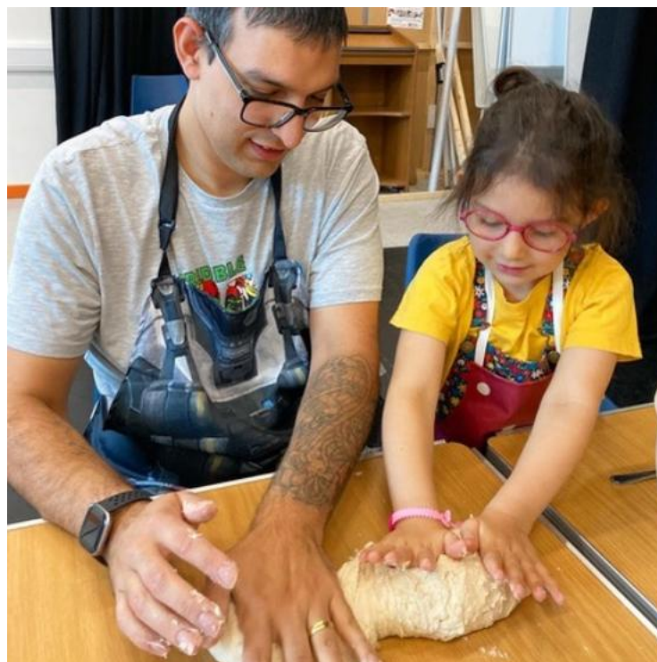
Family cooking activities

The Arts and Crafts Community Centre at Ewyas Harold has created an artistic community, by expanding its exhibiting members and volunteers and providing facilities for families.