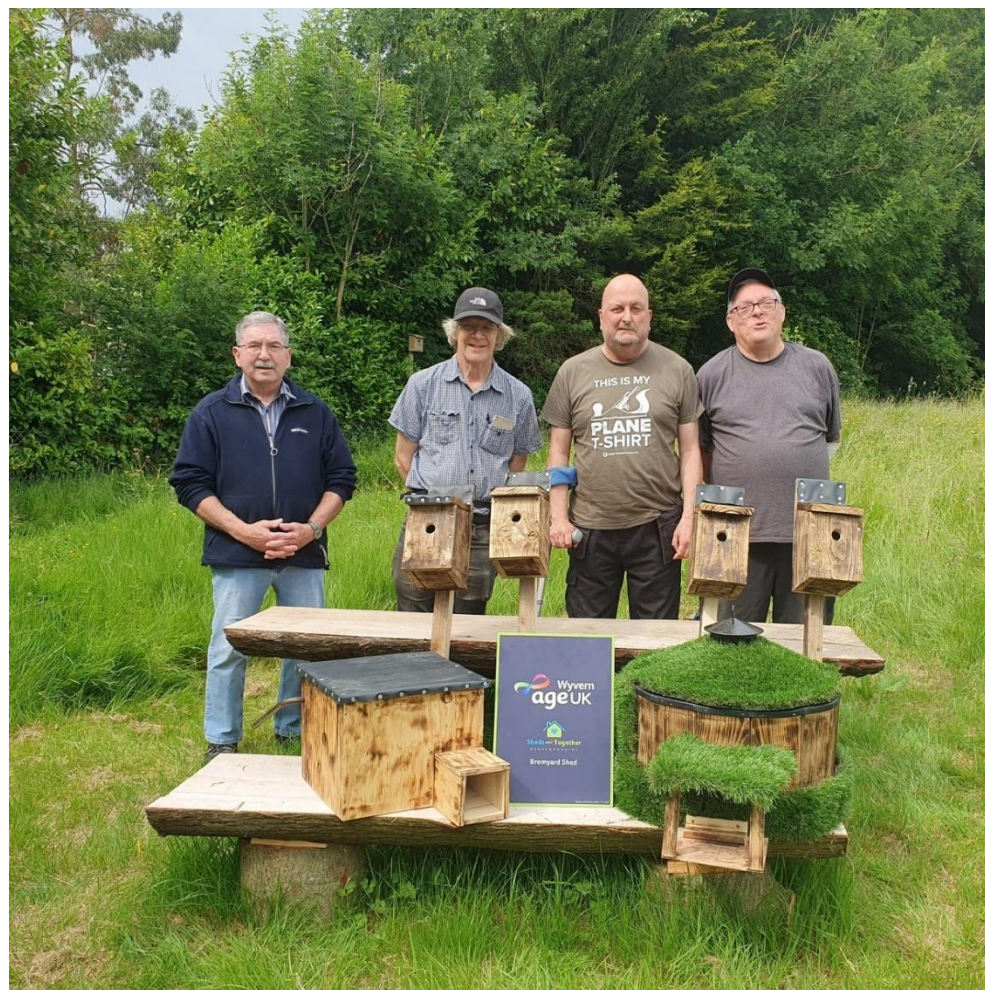
Shedders with bird boxes and hedgehog homes