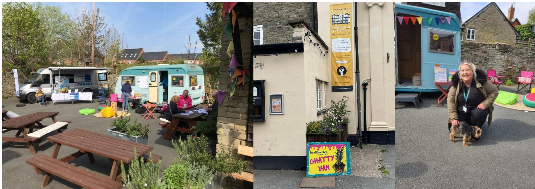
Health Days and Chatty Van