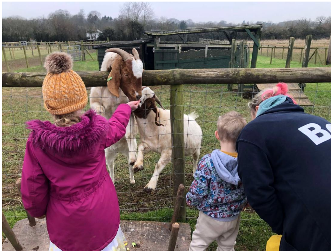
Feeding the goats at Hereford Community Farm

Many families who had a 1:1 session find regular outings difficult and stressful as they feel they are being judged. Having a positive experience together, enhanced their emotional and mental wellbeing and encouraged them to attend Family Days.