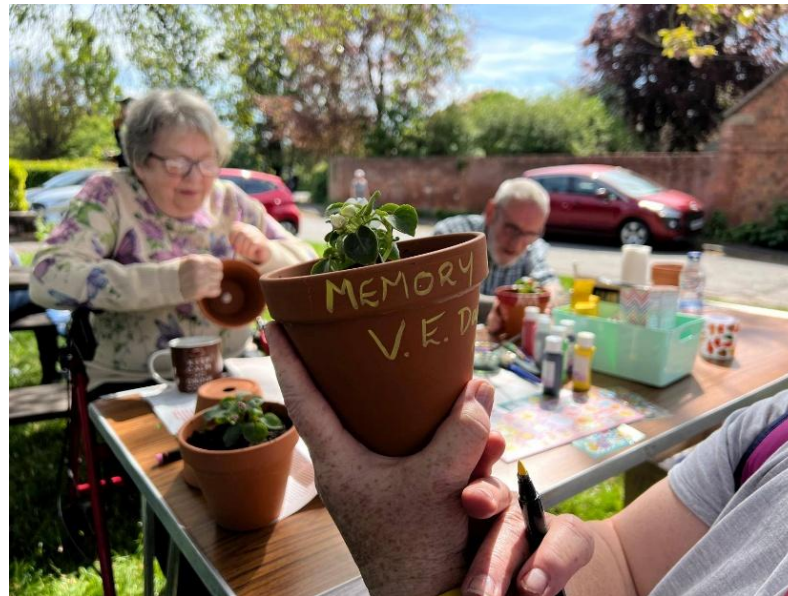
Hereford Community Farm supports planting at St Martin's Food Share

Organisations received both core and project funding, enabling them to explore new initiatives while also sustaining their existing work. This approach stood out by being flexible and responsive to what communities needed most.