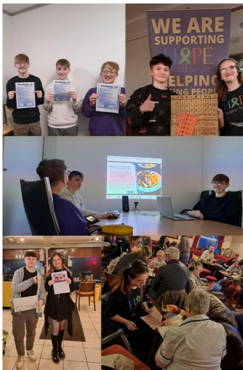
The Y Team

The Y-Team's growing cohesion and interest in social action also look to the future in terms of advocacy and campaigning for the community we support. Two of the Young Wellbeing Advisers/Youth Workers now have experience of running Family Days and understand the dynamics of reaching out to and working with our supported families.