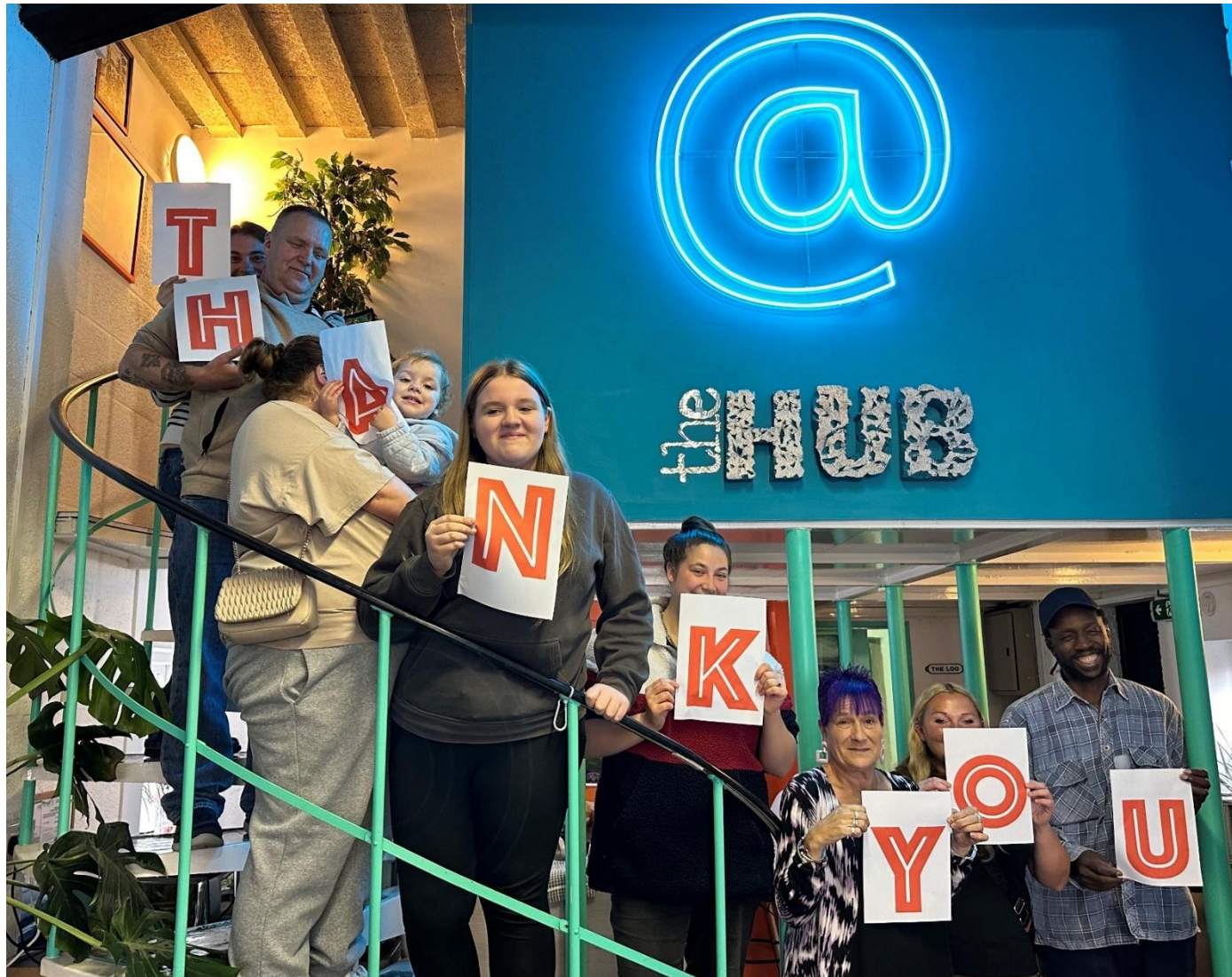
Thank you from regulars of @The Hub, Ross-on-Wye