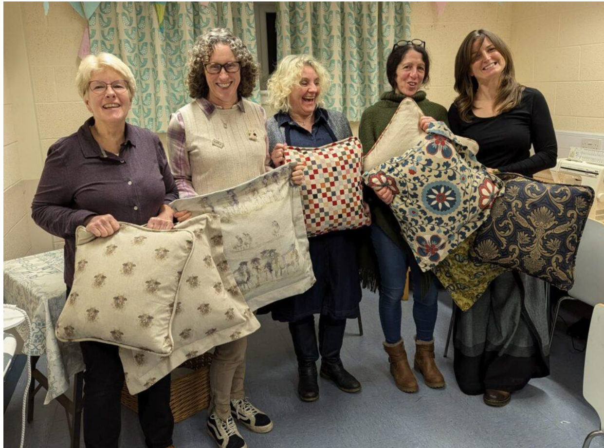
Products from sewing courses at Ewyas Harold Craft Centre

"A lovely craft centre. I wish every village had one!" "Wonderful centre of creativity - so much to love..." "A fantastic display of skilled craftsmanship."